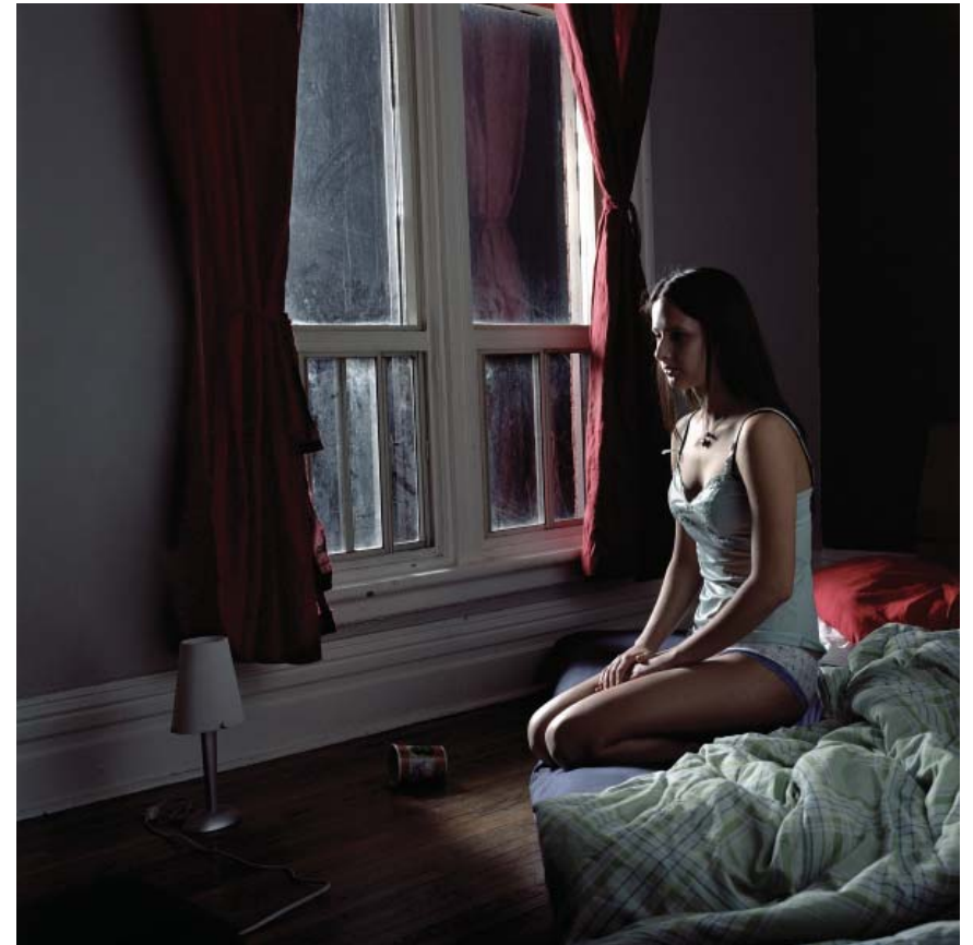
Aphasia, plate 4 , (year).

This strain of decadence can be found in the work of artists such as Edward Hopper, and the photography of Gregory Crewdson and Panos Kokkinias, where the subjects seem to be alone and vulnerable in their own human condition, and each have approached a similar subject in a different and personal way. Currently, the subjects in my work are confronted with, and entrapped in, their own lost paradise.